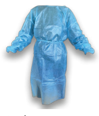
Isolation gown (SMS)