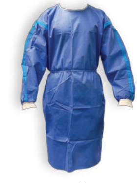
Surgical gown (AAMI Class 2-4)